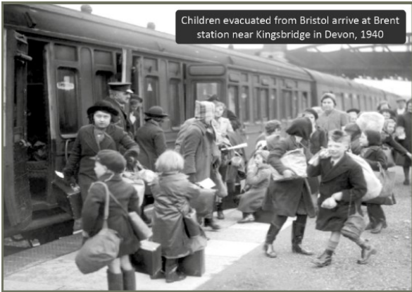
Children evacuated from Bristol arrive at Brent station near Kingsbridge in Devon, 1940

German planes dropped bombs on British cities in an attempt to destroy factories, dockyards and airfields but homes and schools were also hit. The government decided to evacuate children from the cities to the countryside where they would be safer.