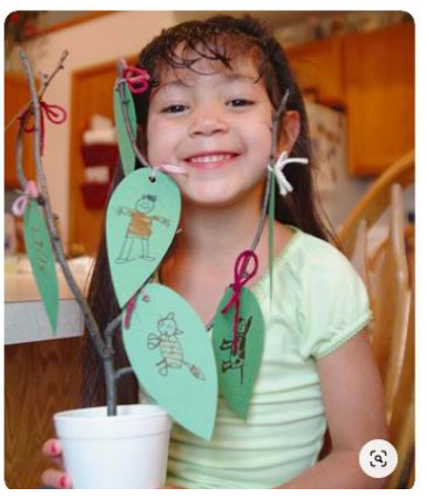
Can you help your child to make a family tree out of natural materials?

The next stage of this activity is to create their own timeline to help them understand the different stages that they pass through as they grow up.